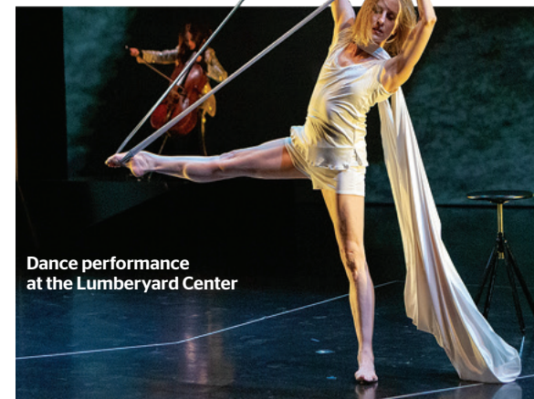
Dance performance at the Lumberyard Center

new dance-theater works by Tony-nominated director Rachel Chavkin and renowned choreographer Bill T. Jones. Fall programming, still being finalized at press time, focuses on